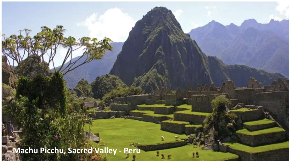
Machu Picchu, Sacred Valley - Peru